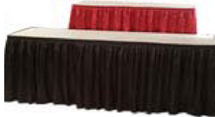
Table Skirt Color: _____ blue _____ red _____ burgundy _____ black _____ green _____ yellow _____ white

(Standard table height is 30in. Add $40 for 40in high skirted table.) (All sizes skirted on three sides. For skirt on 4th side, add $40 on 30in tall table, $60 on 40in tall table)