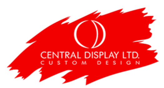
TABLE RENTAL ORDER FORM

UNIT # 7 - 850 MARION ST. WINNIPEG, MB Canada R2J 0K4 Phone: (204) 237-3367 Fax: (204) 235-1063 Email: info@centraldisplay.ca