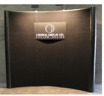
Pop-up Display - 8' x 8' shown