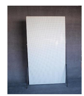
Peg Board - Vertical