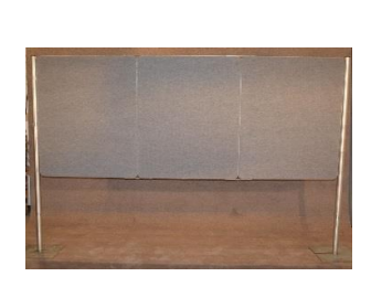
Velcro Poster Board (grey &black side) 4' x 6'