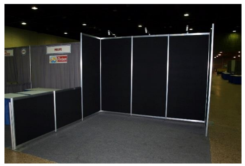
Octanorm – 3 meters shown (sign optional – not shown)