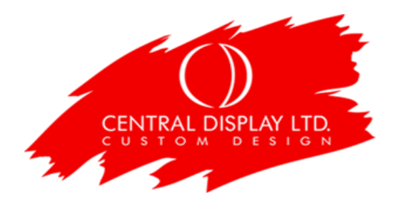
EXHIBIT INSTALLATION SERVICES