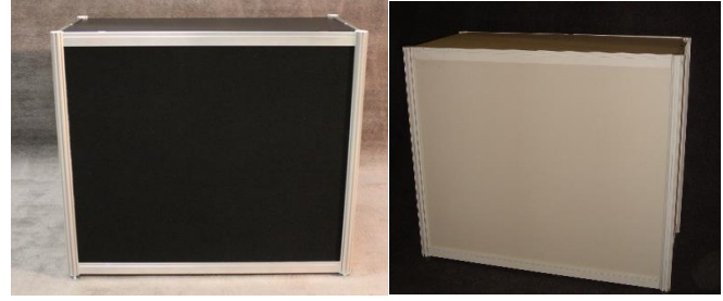
Counters - black or white